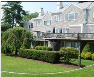
40 California Street